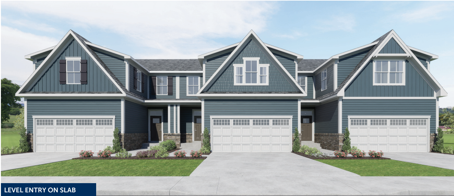
LEVEL ENTRY ON SLAB