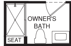
OPT. OWNER'S BATH ALTERNATE LAYOUT