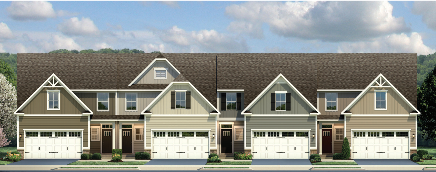
LEVEL ENTRY ON SLAB