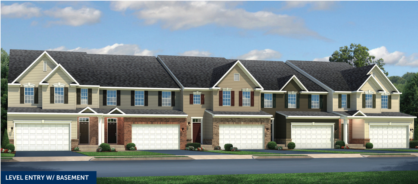
LEVEL ENTRY W/ BASEMENT