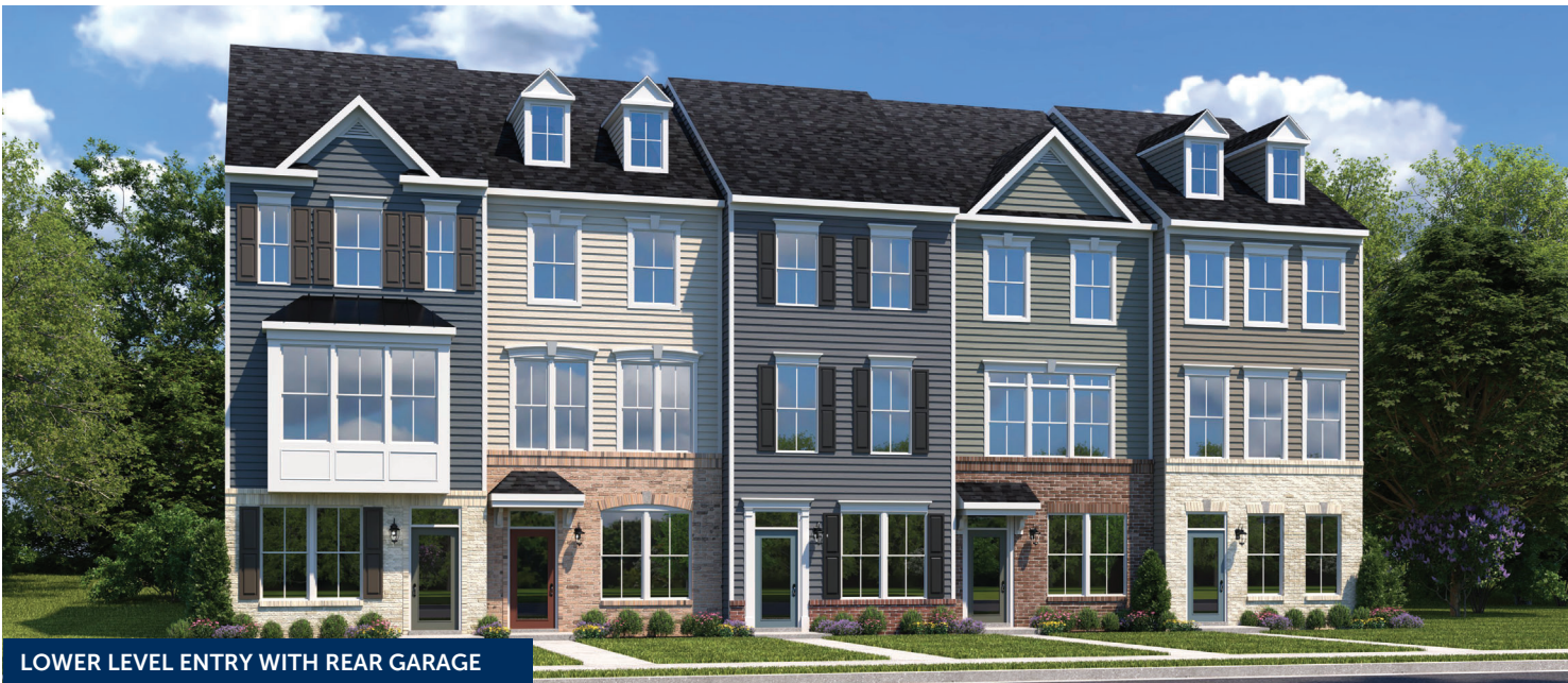
LOWER LEVEL ENTRY WITH REAR GARAGE