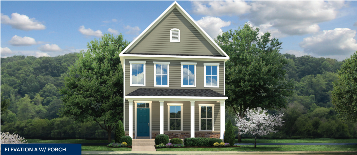
ELEVATION A W/ PORCH