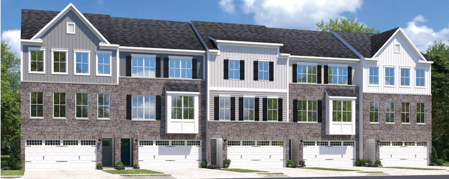
LOWER LEVEL ENTRY WITH FRONT GARAGE