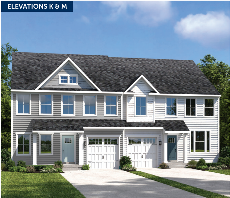
ELEVATIONS K & M