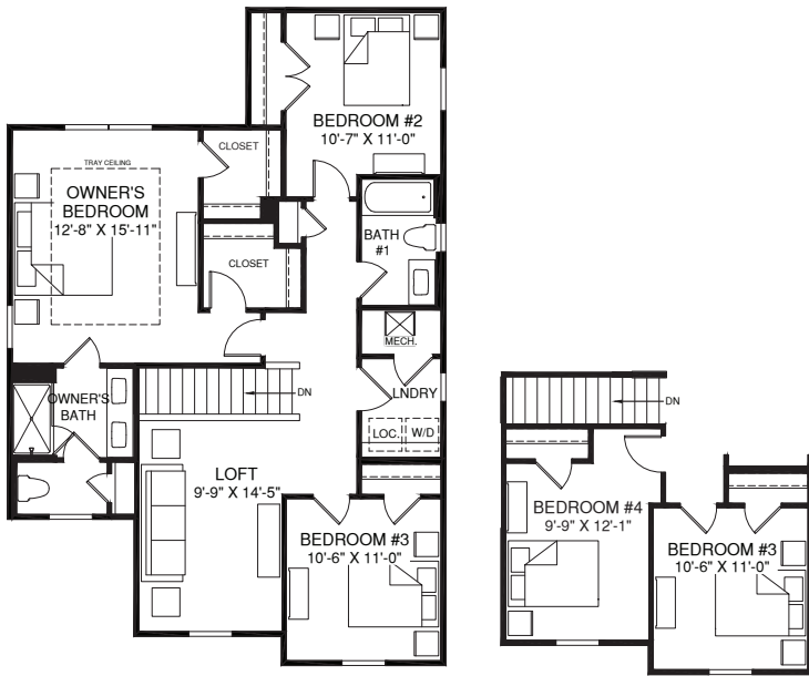
OPT. BEDROOM #4