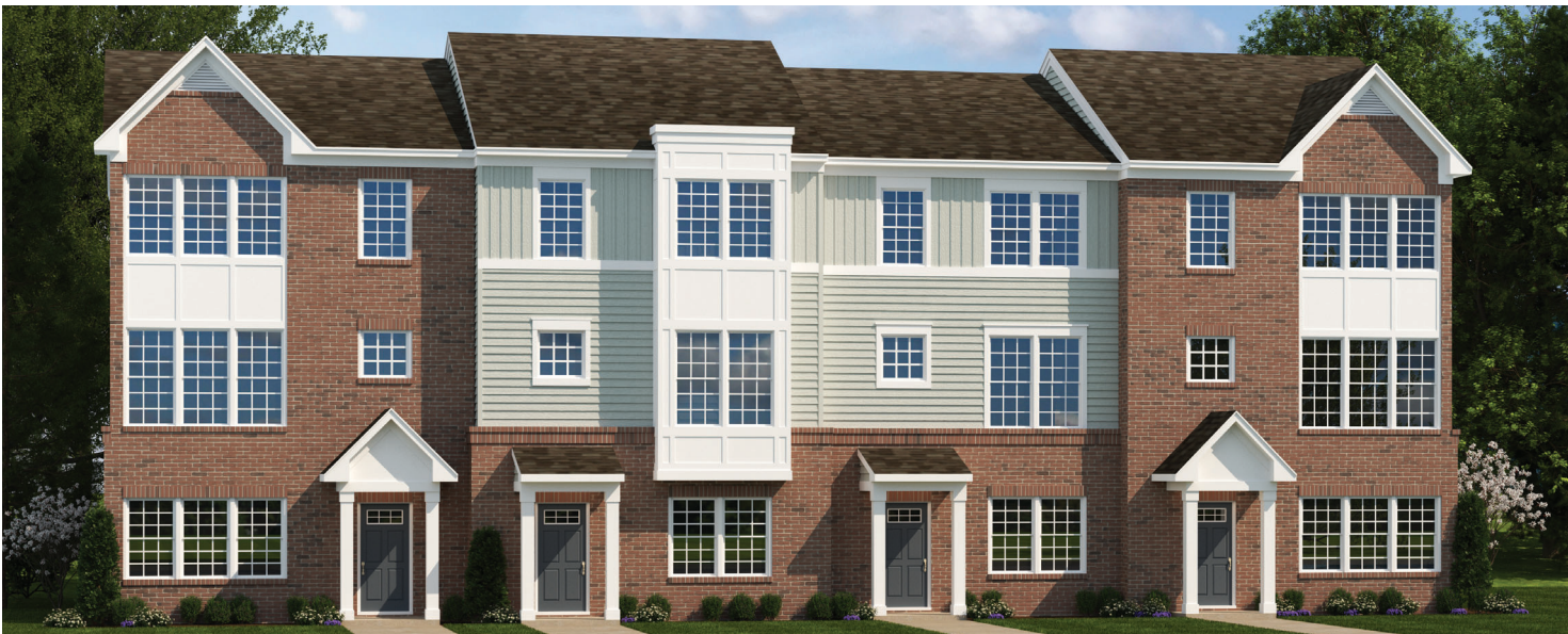
LOWER LEVEL ENTRY WITH REAR GARAGE