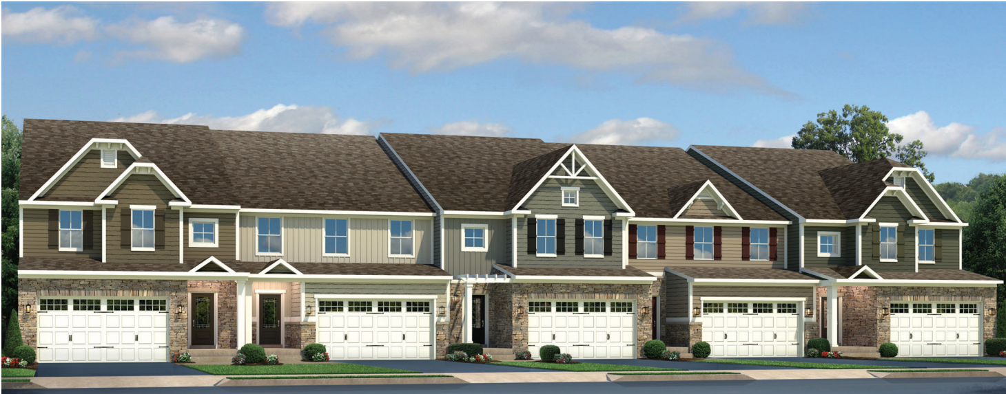
LEVEL ENTRY W/ BASEMENT