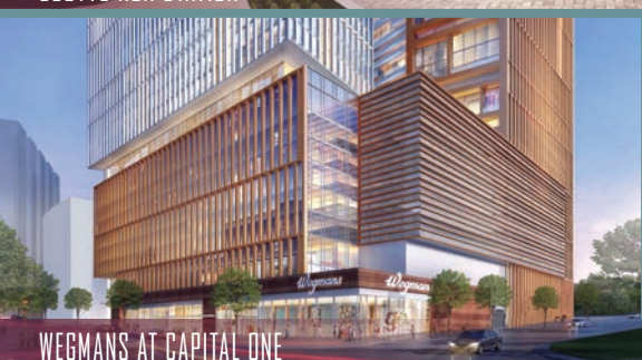
WEGMANS AT CAPITAL ONE