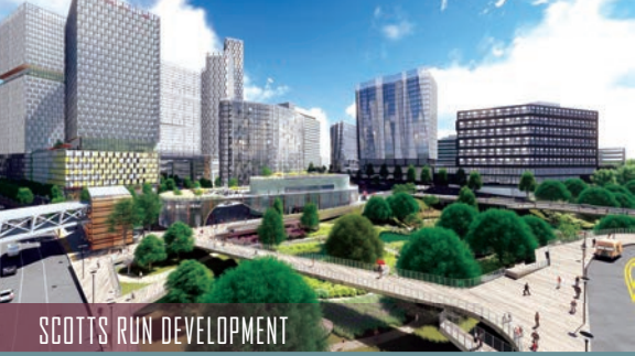
SCOTTS RUN DEVELOPMENT