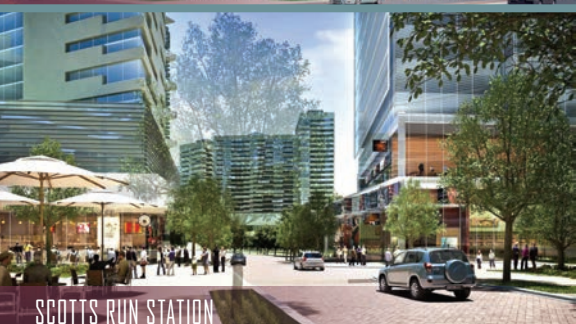
SCOTTS RUN STATION