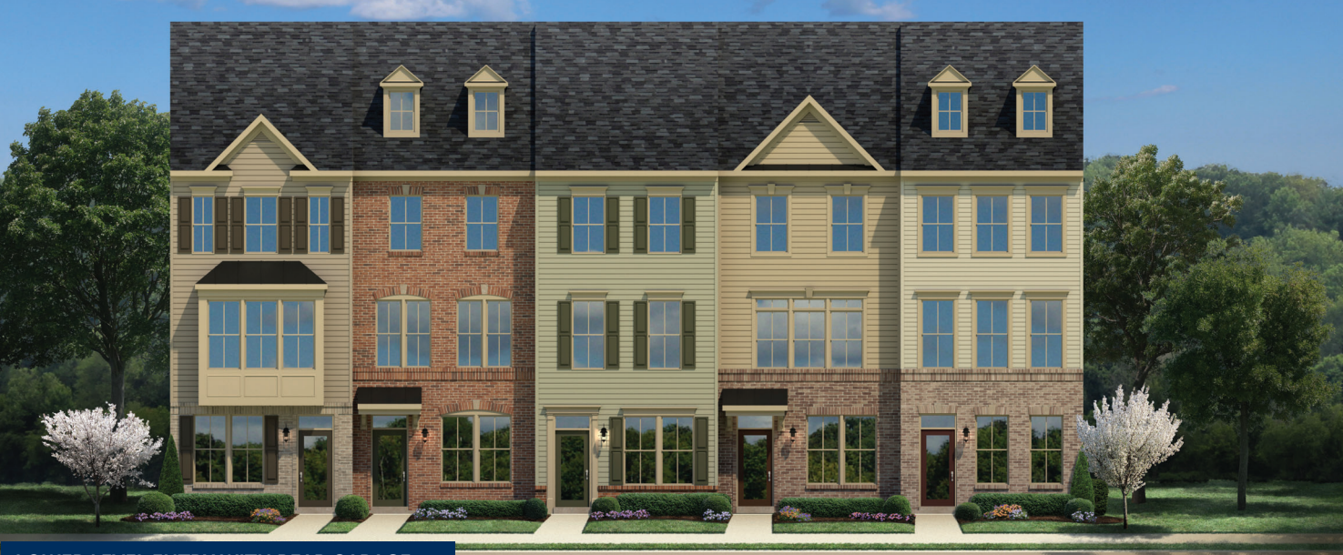
LOWER LEVEL ENTRY WITH REAR GARAGE