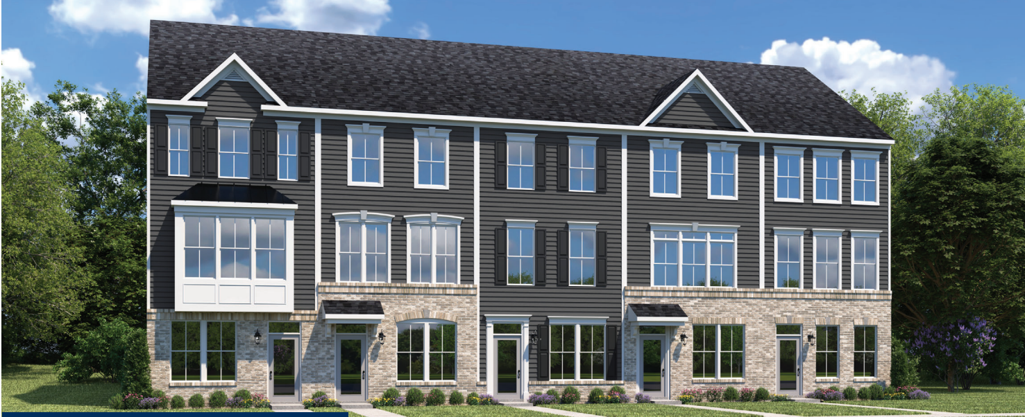
LOWER LEVEL ENTRY WITH REAR GARAGE