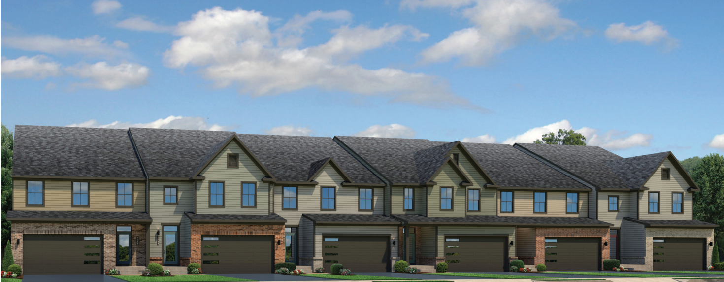
LEVEL ENTRY W/ FRONT GARAGE