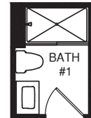
OPT. BATH #1 W/ SHOWER