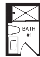
OPT. BATH #1 W/ SHOWER